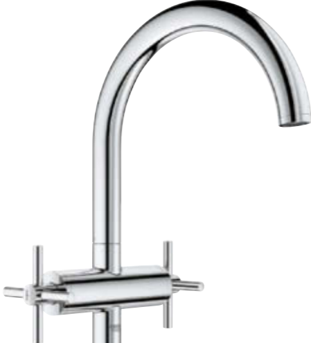
● ● ● 21 044 003 / DC3 / AL3 One-hole basin mixer XL-Size