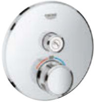
● ● ● ● 29 118 000 / DC0 / AL0 Grohtherm SmartControl thermostat for concealed installation with 1 valve + separate concealed body