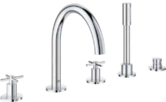
● ● ● 19 923 003 / DC3 / AL3 Five-hole bath combination