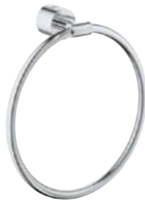
● ● ● 40 307 003 / DC3 / AL3 Towel ring