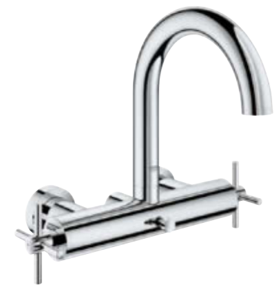
● ● ● 25 010 003 / DC3 / AL3 Bath mixer wall mounted