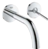
● ● ● 19 287 003 / DC3 / AL3 Two-hole basin mixer joystick wall mounted set for final installation 23 429 000 projection 185 mm 19 918 003 / DC3 / AL3 projection 221 mm