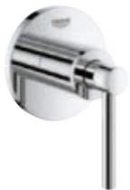
● ● ● 19 088 003 / DC3 / AL3 Concealed valve exposed part for GROHE concealed valve 35 028 000 or 29 032 000