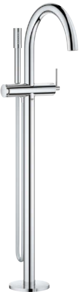
● ● ● 32 653 003 / DC3 / AL3 Single-lever bath mixer floor mounted set for final installation for 45 984 001