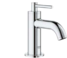
● ● ● 20 021 003 / DC3 / AL3 Pillar tap XS-Size