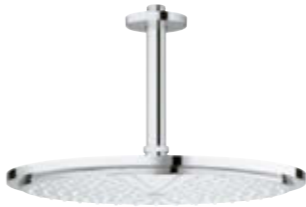
● ● ● ● 26 067 000 / DC0 / AL0 Head shower set Rainshower 310 1 spray pattern: Rain