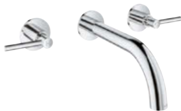
● ● ● 20 169 003 / DC3 / AL3 Three-hole basin mixer wall mounted set for final installation 29 025 000 projection 180 mm