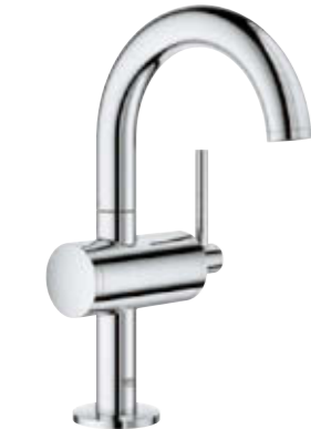
● ● ● 32 043 003 / DC3 / AL3 Single-lever basin mixer M-Size