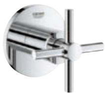
● ● ● 19 069 003 / DC3 / AL3 Concealed valve exposed part for GROHE concealed valve 35 028 000 or 29 032 000