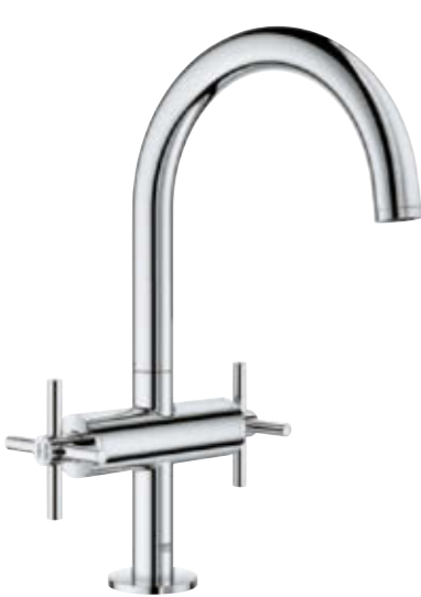
● ● ● 21 019 003 / DC3 / AL3 One-hole basin mixer L-Size