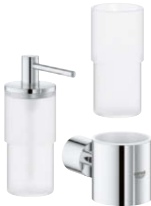
● ● ● 40 306 003 / DC3 / AL3 Soap dispenser 40 304 003 / DC3 / AL3 Glass holder without glass 40 254 003 Glass