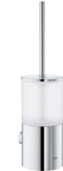
● ● ● 40 314 003 / DC3 / AL3 Toilet brush set wall model