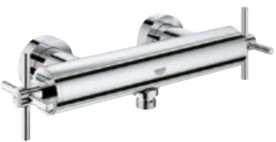
● ● ● 26 003 003 / DC3 / AL3 Shower mixer wall mounted