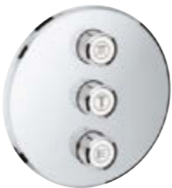
● ● ● ● 29 122 000 / DC0 / AL0 Grohtherm SmartControl triple volume control trim + separate concealed body