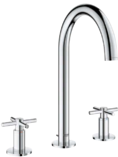
● ● ● 20 008 003 / DC3 / AL3 Three-hole basin mixer