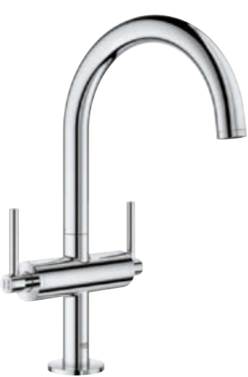
● ● ● 21 022 003 / DC3 / AL3 One-hole basin mixer L-Size