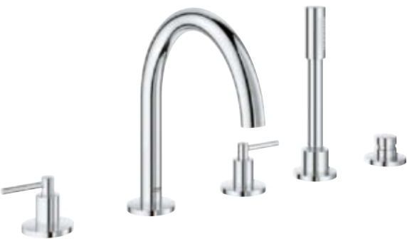
● ● ● 19 922 003 / DC3 / AL3 Five-hole bath combination

Replace the second and third last digit and replace by the below colour code to order the coloured version. Colour options: ● 00 | StarLight Chrome ● DC | SuperSteel ● AL | Brushed Hard Graphite