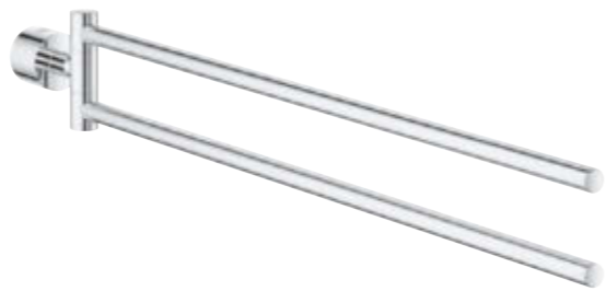
● ● ● 40 308 003 / DC3 / AL3 Towel bar length 489 mm / 2 parts