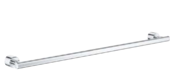
● ● ● 40 309 003 / DC3 / AL3 Towel rail 600 mm