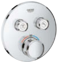
● ● ● ● 29 119 000 / DC0 / AL0 Grohtherm SmartControl thermostat for concealed installation with 2 valves + separate concealed body