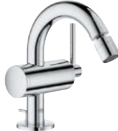
● ● ● 32 108 003 / DC3 / AL3 Single-lever bidet mixer

Replace the second and third last digit and replace by the below colour code to order the coloured version. Colour options: ● 00 | StarLight Chrome ● DC | SuperSteel ● AL | Brushed Hard Graphite