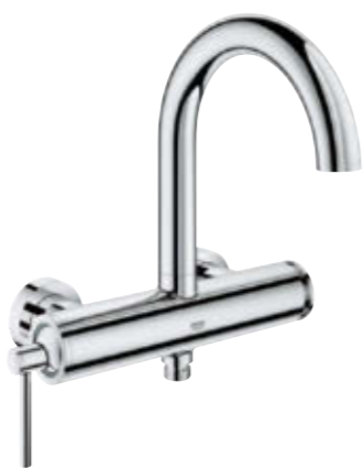
● ● ● 32 652 003 / DC3 / AL3 Single-lever bath mixer wall mounted