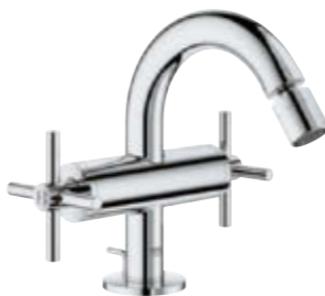
● ● ● 24 027 003 / DC3 / AL3 Single-hole bidet mixer