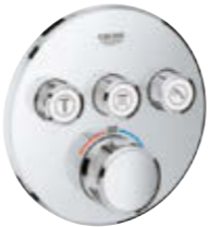
● ● ● ● 29 121 000 / DC0 / AL0 Grohtherm SmartControl thermostat for concealed installation with 3 valves + separate concealed body