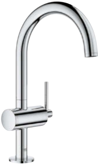
● ● ● 32 042 003 / DC3 / AL3 Single-lever basin mixer L-Size