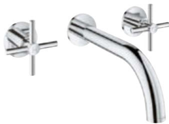
● ● ● 20 164 003 / DC3 / AL3 Three-hole basin mixer wall mounted set for final installation 29 025 000 projection 180 mm