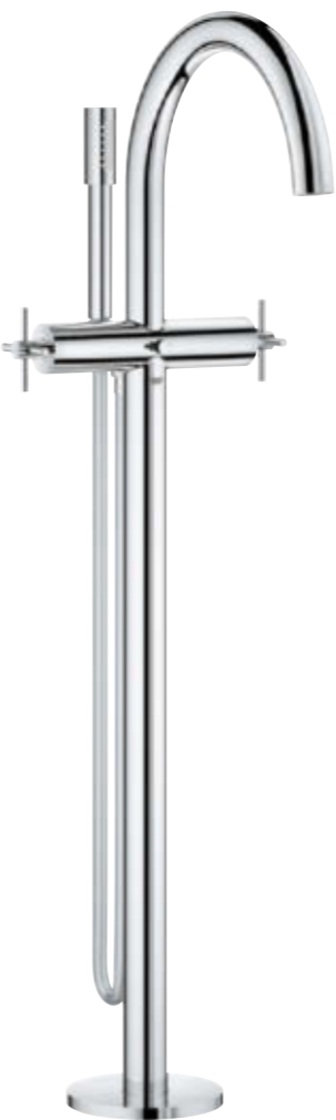
● ● ● 25 044 003 / DC3 / AL3 Bath mixer floor mounted set for final installation for 45 984 001