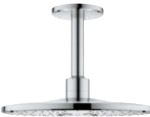
● 26 477 000 Rainshower 310 SmartActive 2 spray pattern: GROHE PureRain, ActiveRain