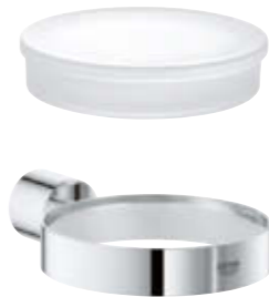
● ● ● 40 305 003 / DC3 / AL3 Holder for soap dish 40 256 003 soap dish

Replace the second and third last digit and replace by the below colour code to order the coloured version. Colour options: ● 00 | StarLight Chrome ● DC | SuperSteel ● AL | Brushed Hard Graphite