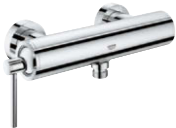
● ● ● 32 650 003 / DC3 / AL3 Single-lever shower mixer wall mounted