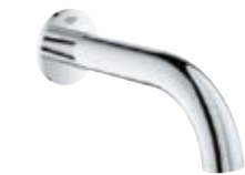
● ● ● 13 139 003 / DC3 / AL3 Bath spout wall mounted