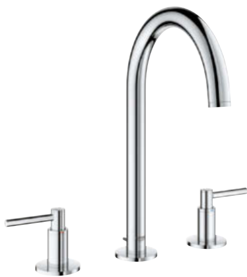
● ● ● 20 009 003 / DC3 / AL3 Three-hole basin mixer