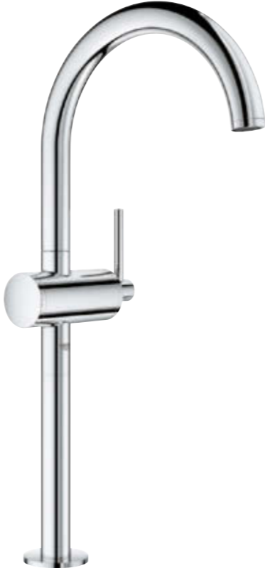
● ● ● 32 647 003 / DC3 / AL3 Single-lever basin mixer XL-Size